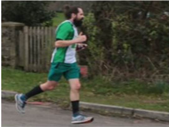
A sample of Dave Hibbert's photos from the Lytchett 10