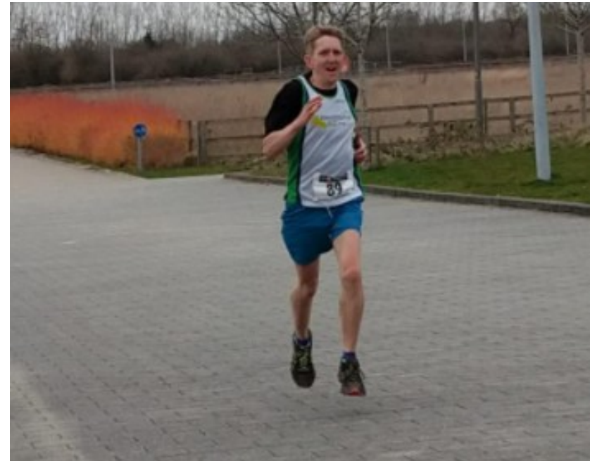
A classic example of the Loneliness of the Long Distance Runner school of photography